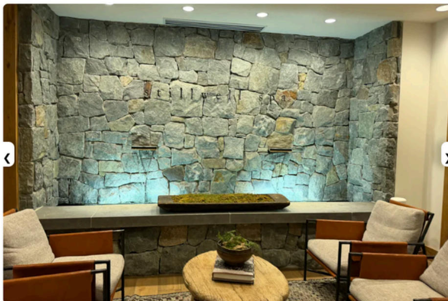
Stillwell Spa, located on the second floor.

Wellness is clearly a major focus, with a full-service spa (with a grotto), yoga room, and fitness center on the second floor. Conveniently, this was where our room was located.