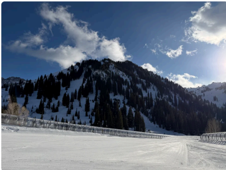
Learner lift areas complete with magic carpets.

Alta falls well within that range, nestled in the Cottonwood Canyons alongside Brighton, Snowbird, and Solitude, with Park City and Deer Valley also within reach from the airport. Since we wanted a skier-only experience , we narrowed our choices to Deer Valley and Alta, ultimately choosing Alta for its proximity to our house — just a 25-minute drive away.