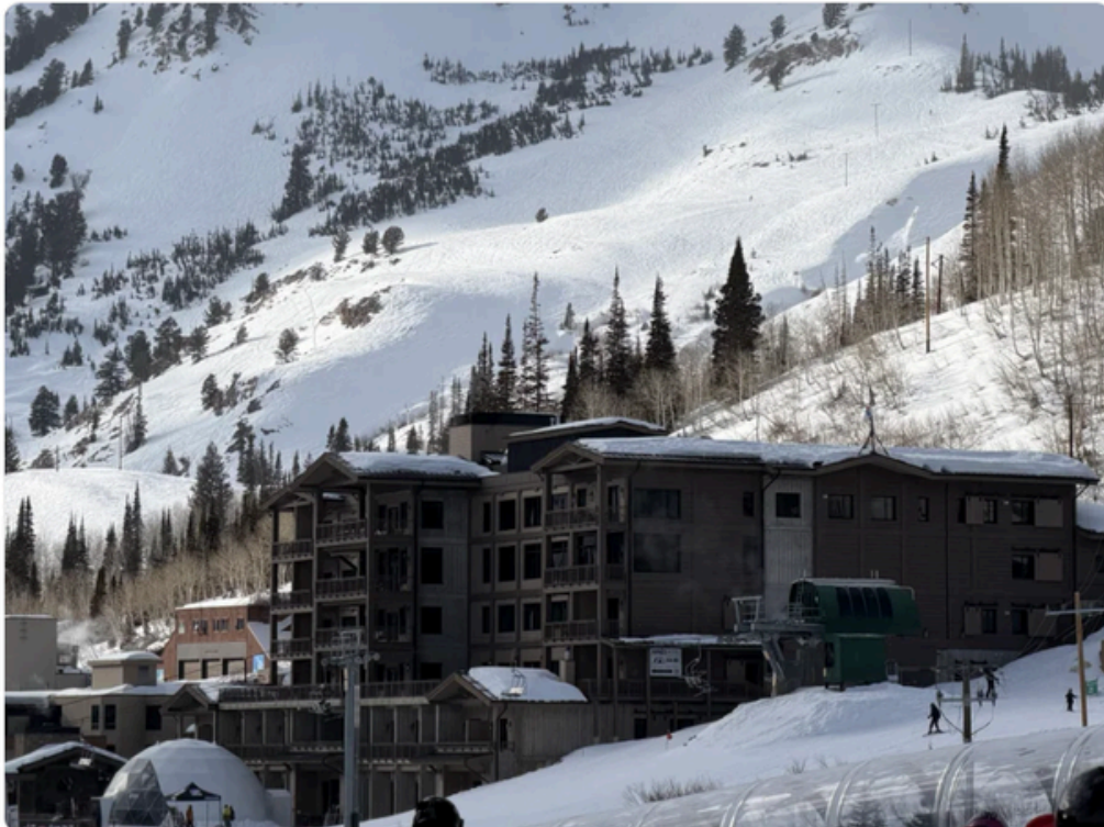
The view of Snowpine Lodge from Alta's bunny hills.

As a hotel guest, Snowpine Lodge's location couldn't be more convenient for accessing Alta Ski Resort, offering true ski-in, ski-out access right at the base of the mountain.