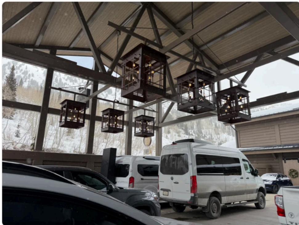
Valet parking is required in the winter and costs $55 per night.

The moment we pulled up, the valet team took care of our belongings and seamlessly guided us through check-in, taking time to explain the property layout and give us a complimentary s'mores kit.