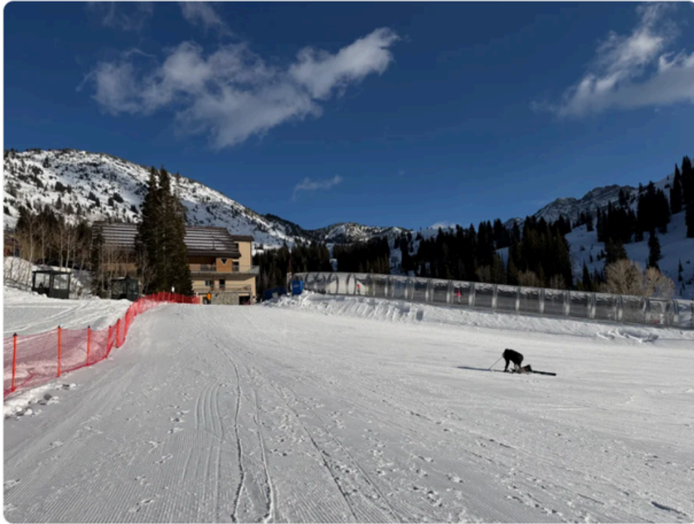
You can buy a beginner lift ticket for $85 if you're not ready for the big slopes.

While Alta Ski Area is well known for its challenging terrain favored by expert skiers, it was also frequently recommended to us beginners for its Alf Engen Ski School and wide, forgiving learning areas.