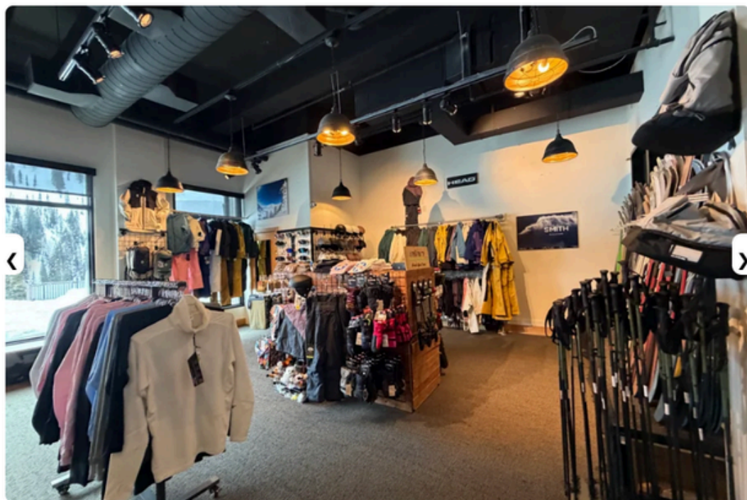
Jackson's Base Camp ski shop.

Finally, on the bottom floor was a complimentary ski valet with no shortage of lockers and a ski shop for all your gear needs.