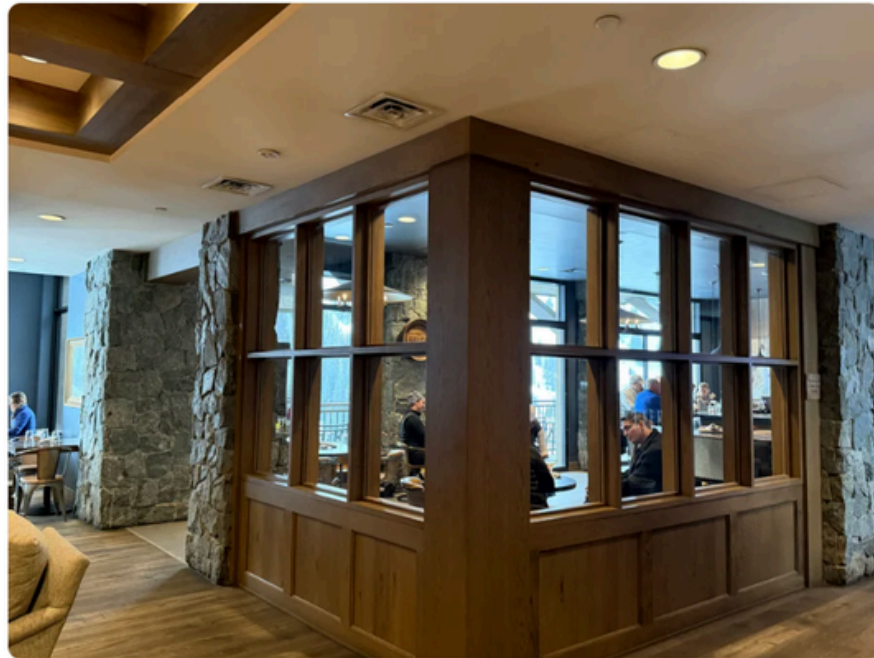
The Gulch Pub.

The Gulch Pub is a full-service bar that's enclosed from the lobby. We didn't visit as we're nondrinkers, but next time we'll visit for bar bites, such as the chicken wings that everyone was raving about. Due to state laws, you'll need to show your ID before entering the bar, regardless of whether you're consuming alcohol.