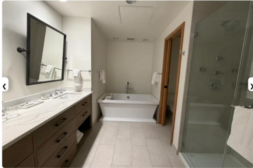
The bathroom was just as generously sized as the guest room.

The bathroom was just as generous in size, complete with double vanities, a soaking tub, a separate shower, and a separate water closet.