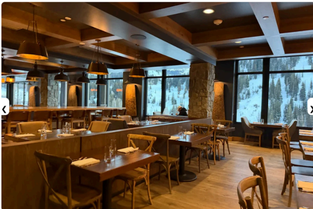
Check out those views.

We had dinner reservations at Swen's, an upscale restaurant located on the ground floor with gorgeous mountain views. As per our waitress' recommendations, we ordered the filet mignon ($68) and scallops ($26), which were perfectly cooked to our liking.