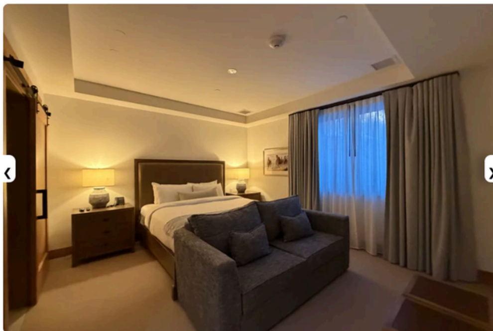
Overview of the guest room.

Even though we weren't staying in a suite, the King guest room felt impressively spacious, with a sofa that doubled as a sleeper and separated the living area from the sleeping space.