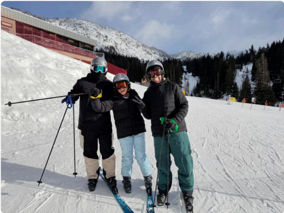
We had the best time.

We loved renting gear from the on-site shop, with staff who were incredibly knowledgeable and took their time to size us appropriately.