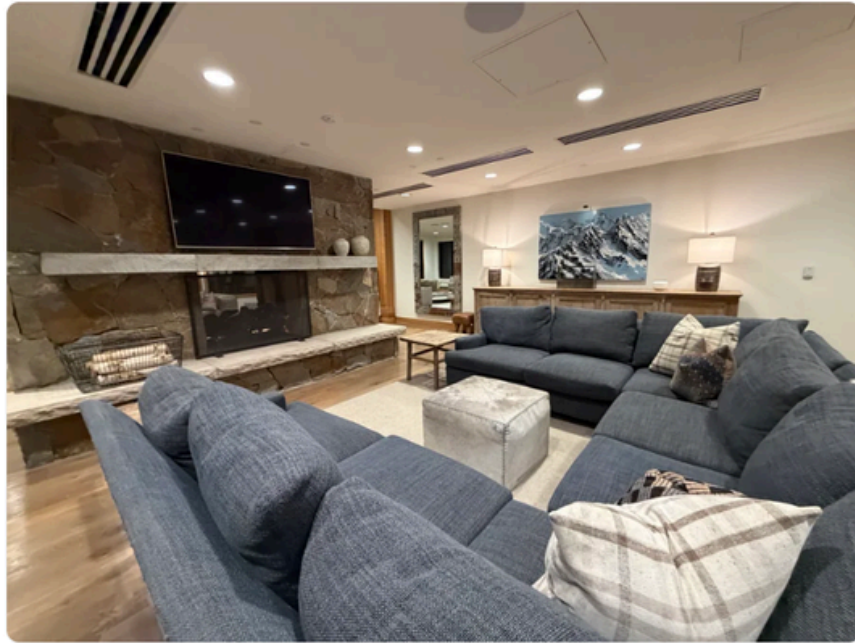
Every floor had a living room with oversized couches and fireplaces, almost like natural extensions of the rooms.

We arrived a few hours before the 4 p.m. check-in time and used the extra time to grab lunch and explore the property. What immediately stood out were the expansive living rooms on each floor, which were inviting spaces where guests could gather, relax, and play games together.