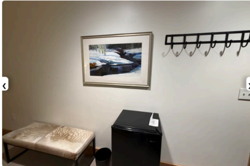
Entrance to the room.

The closet was spacious, and there were also hooks to hang up our stuff to dry overnight, which we greatly appreciated. Complimentary in-room amenities included a larger-than-average minifridge, a humidifier, a Nespresso machine, and additional built-in storage tucked into the bar area.