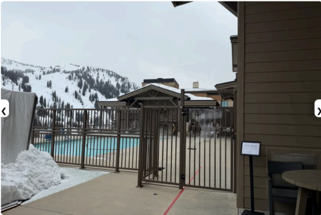
Outdoor pool and hot tub area.

There was an outdoor heated pool and hot tubs (a must for easing sore joints after a day on the mountain), along with a massive game room complete with a movie theater and a ball pit that was a hit with both kids and adults. Guests can also take advantage of the complimentary laundry room, which is convenient for those with longer stays.